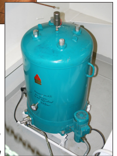
CJC® Oil-Care System 427/81 installed in the engine room