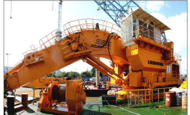
Liebherr Pontoon Excavator P 995 Litronic on spud carriage pontoon MP40 - in use for construction of the deep-water container terminal JadeWeserPort in Wilhelmshaven.

Josef Möbius Bau-Aktiengesellschaft : "We are very satisfied with the test results and intend to install further CJC Fine Filters."