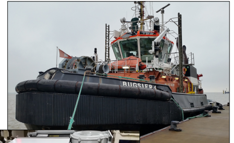
Tug boat "Bugsier-4"

The CJC® Desorber D5 has lowered the water content from 903 ppm (0.09 %) to 109 ppm (0.01 %). The laboratory of the oil manufacturer (Shell LubeAnalyst) analyzed the zero sample and the two months later taken oil sample. The CJC® System removes free water (2-phases) and emulsified water (finely divided in oil) as well as dissolved water (not visible) from the oil. Important, because pressure and temperature changes lead to the release of dissolved water resulting in the same harmful impact on components and oil as emulsified and free water. To keep the water out of the oil system is essential to avoid abnormal wear, corrosion, cavitation, reduced lubricity, and accelerated oil degradation.