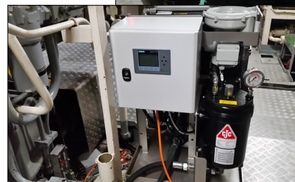
Photo, left: CJC® Desorber D5 with CJC® Oil-Care System 15/25 installed for cleaning the gear oil of the thruster.