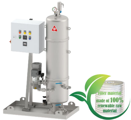
CJC™ Filter Separator P4 27/81